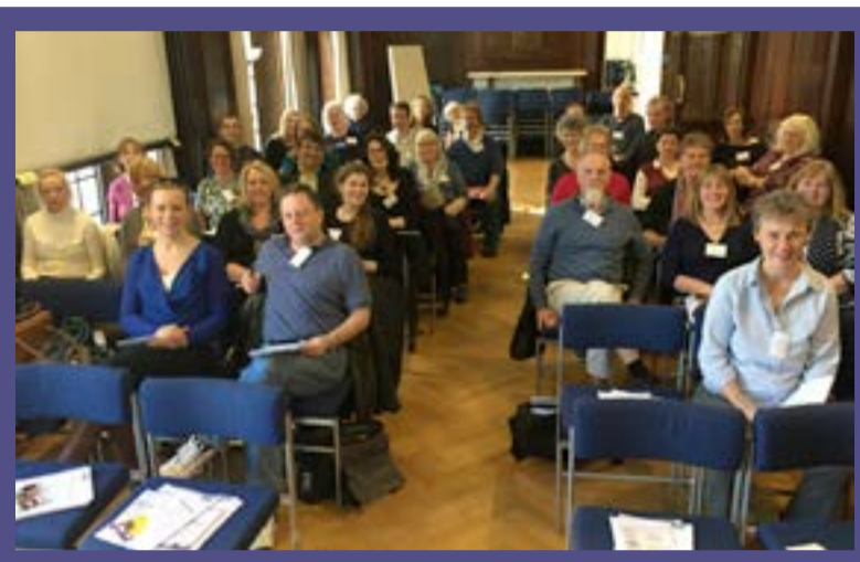
CNHC PSB members, March 2017

Many thanks to all of the PSB members who attended. This was a very productive meeting and we very much appreciate the commitment and support shown by all who take on this important role.